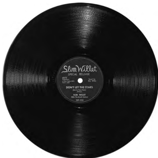
The original release of 'Stars' on the Slim Willet label.