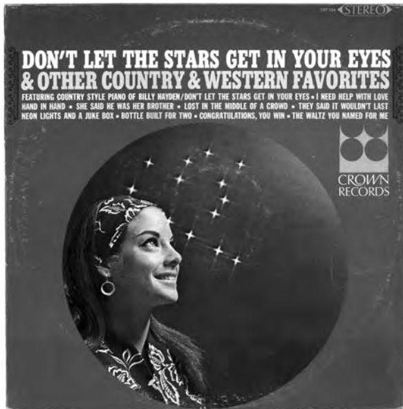
LP cover highlighting "Stars."

composition as "No Hay Que Dejarse Ilusionar," which literally translates as "Don't Let Yourself Be Fooled." 64