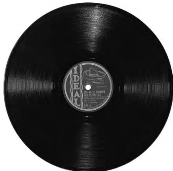
Beto Villa's Spanish-language version of 'Stars.'