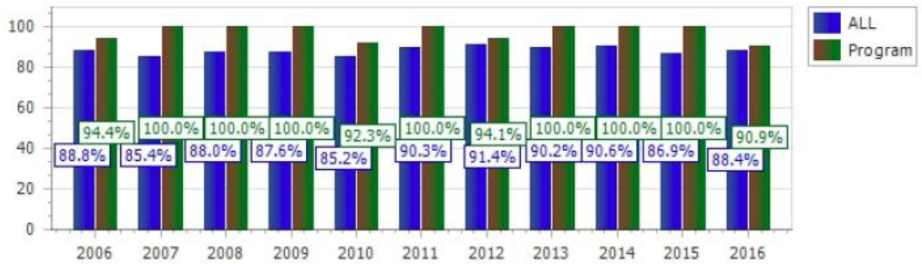
Program vs Total Pass Percentage

Calendar Year Group Number Candidates Section Means Total Mean Percentile Rank % Pass A B C D E