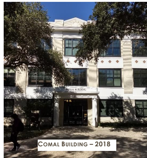
COMAL BUILDING - 2018

In 1977 the building became the Psychology Building and served that college until the recent renovation work was undertaken from 2013-15. The Comal Building now houses Philosophy and Computer Science and begins a second century of service to our University.