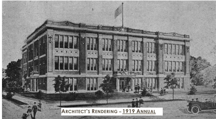
ARCHITECT'S RENDERING - 1919 ANNUAL

In 1917 the Board of Normal Regents raised the status of the state's "normal schools" to full four-year colleges and in response the Southwest Texas State Normal College began offering a Bachelor's Degree in Education with the 1918-1919 school year. Attendance at the college reached a heady 1,087 students in 1917, and additional space was clearly needed.