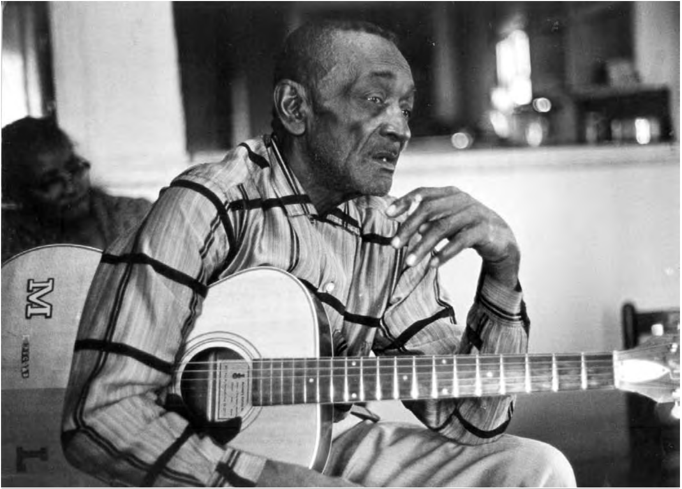
Mance Lipscomb, 1967.