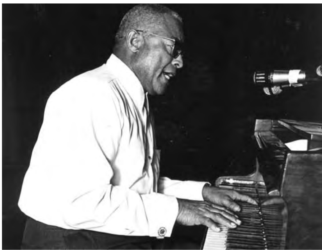
Robert Shaw, 1971.