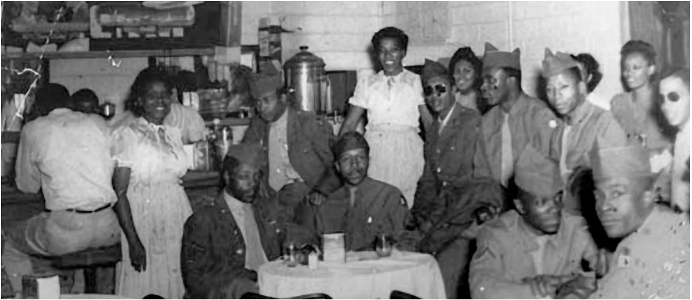
The Victory Grill in Austin, circa 1945.