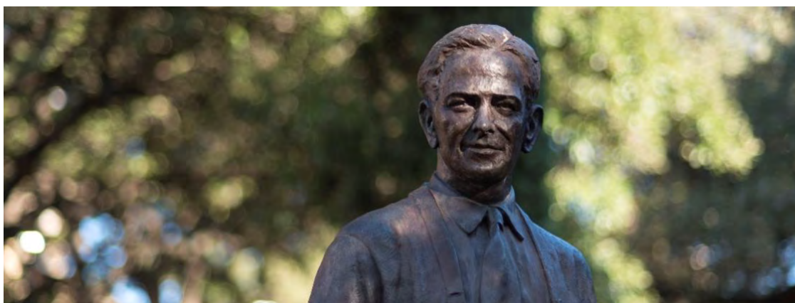
Lyndon Baines Johnson, 36th president of the United States, 1930 Graduate