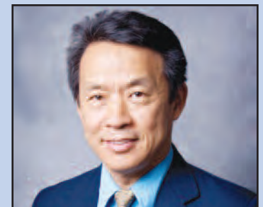
For more information see page 17.