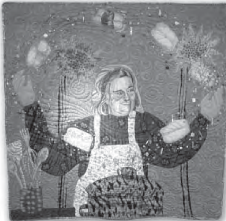
Quilt depicting Julia Child in "Women of Taste" exhibit.

In the meantime, the staff moved into a room in the adjoining River's Edge Restaurant and continued developing exhibits and educational programs and conducting research and grant writing activities. The staff took advantage of the restaurant's spacious interior, with its grand forty-foot ceilings spanned by rustic beams and a massive stone