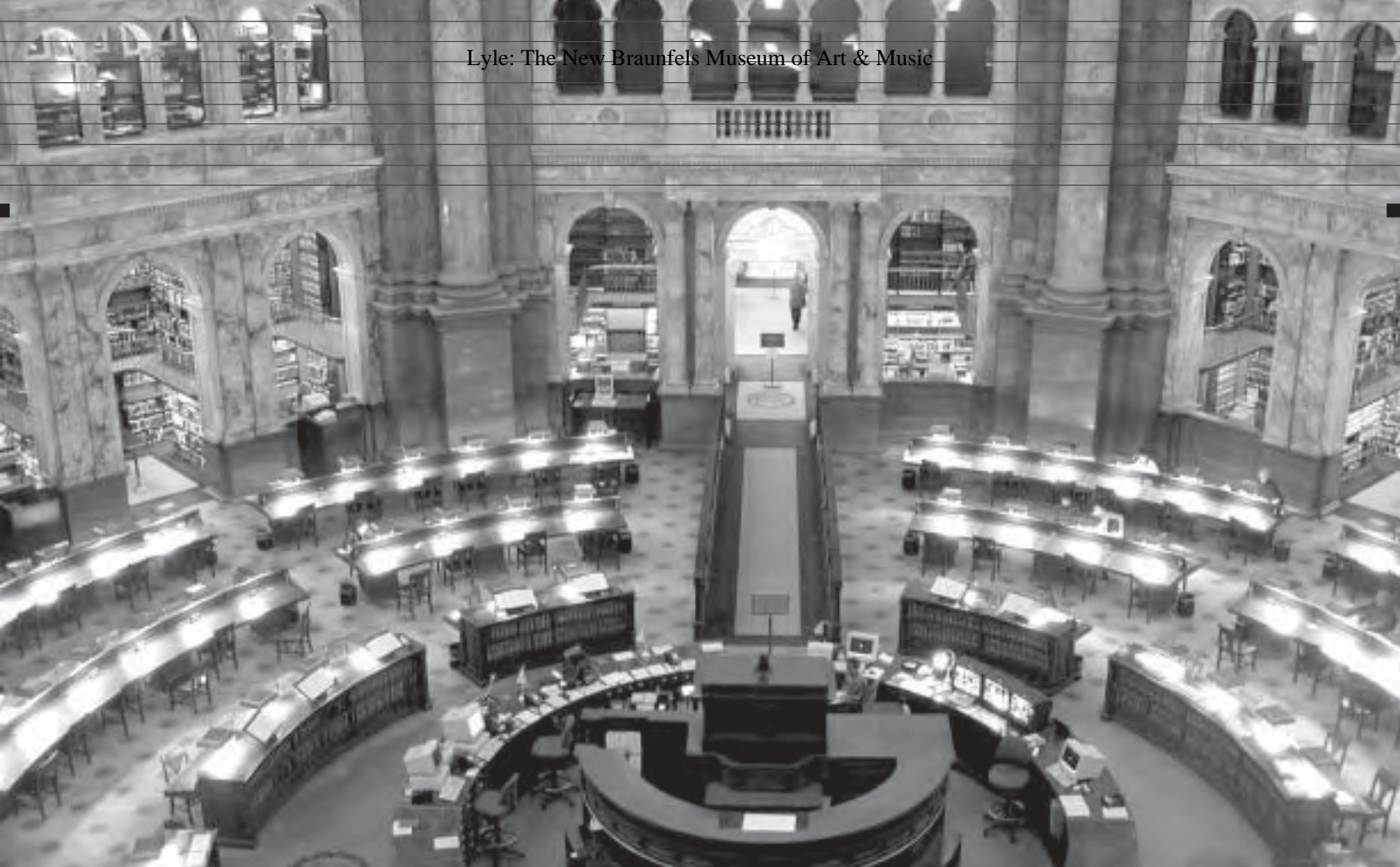
Library of Congress, Washington, D.C. Photo courtesy of Craig D. Hillis.