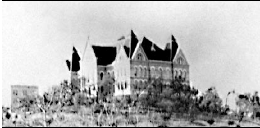
Figure 1. Old Main in the Early Years.

limestone topography, and rocky terrain makes commercial agriculture difficult, if not impossible.