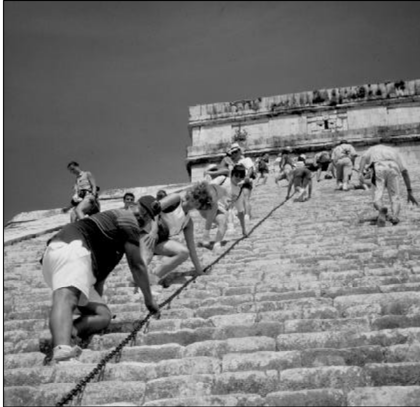
Figure 9: Students on Yucatan Field Trip.

tions of SWIG at SWT and other universities in promoting a hospitable climate for women in geography, thereby enhancing SWT's increasing national reputation as a department with strong support for women and minority students.