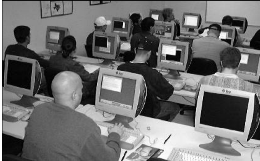
Figure 11. One of Two Sun Microsystems Thin-client Teaching Labs.

increasing progress toward more opportunities for members of underrepresented ethnic minority groups. The “Step Up to Geography” distance learning program has emphasized outreach to Latino teachers in South Texas and other underserved areas of the state. In 2001, the National Geographic Society’s Educational Foundation and the U.S. Department of Education provided the department with funding for a Geography Academy program, in which high school teachers and their outstanding minority students will spend time in the department learning about modern geography, its powerful geo-technologies, and potential rewarding professional careers. It is anticipated that these programs will enhance the department’s efforts to recruit larger numbers of Hispanic, African-American, and Asian undergraduate and graduate students in the years ahead. Indeed, the future looks very bright for all of SWT Geography’s 500 undergraduate majors, 150 master’s students, and 30 Ph.D. students.