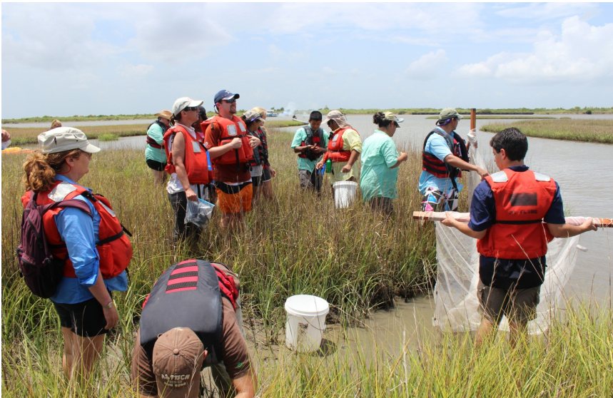
Teachers on the Intracoastal Waterways Wetland Expedition collect plants, seine for fish, and conduct water quality in the wetlands.