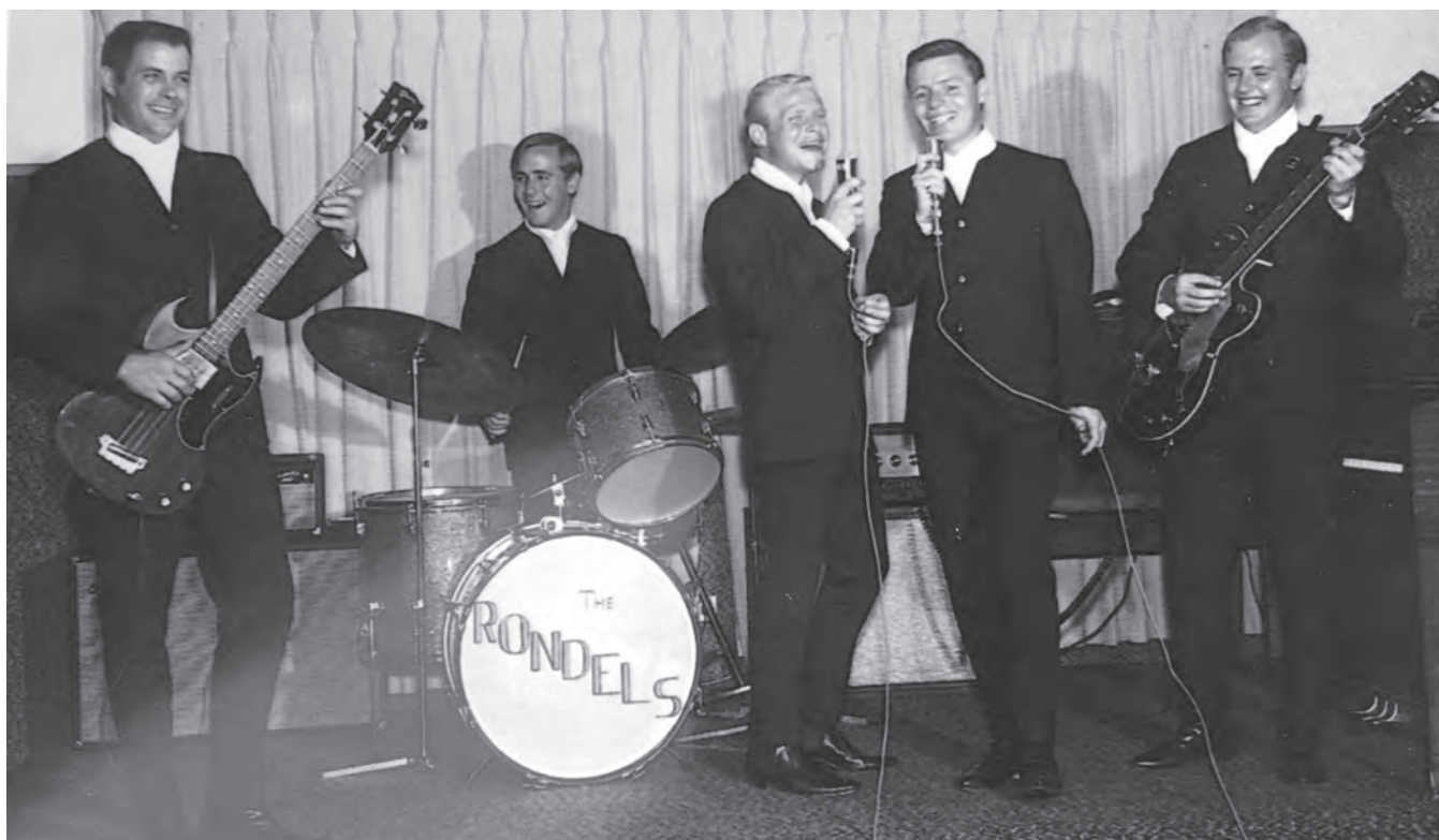
The RonDels.